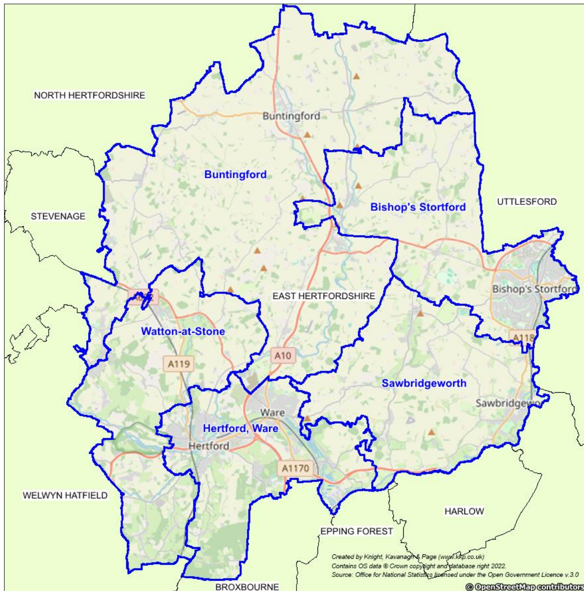
Figure 1.1: Analysis areas